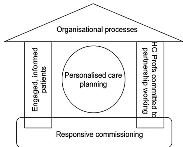
Figure 1 House of Care. Reproduced with permission of The King's Fund. Source: Coulter A, Roberts S, Dixon A (2013). Delivering better services for people with long-term conditions: building the house of care . London: The King's Fund. Available at: http://www.kingsfund.org.uk/publications/delivering-better-services-people-long-term-conditions

The concentric circles around the interactions between patients and professionals suggest that these